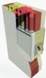
Integrated into wall U 2 version with ductwork connection