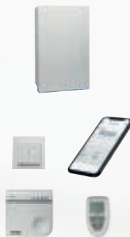
Wireless operation via radio / app