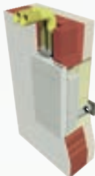
Flush-mount version with ductwork connection